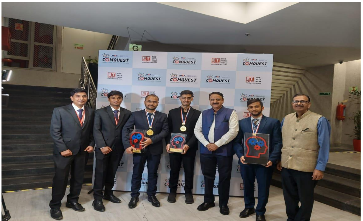
Figure 2 With Winners of Compquest 2023