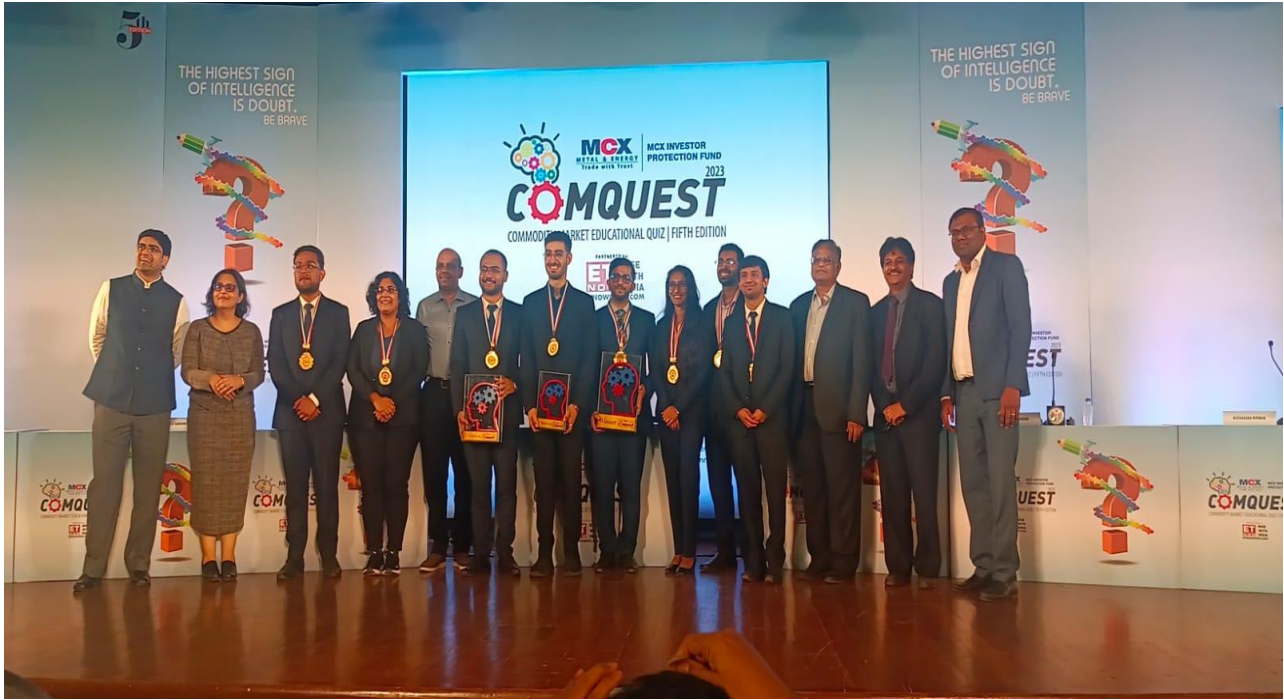
Figure 1 Eight Finalist with winners and MD of MCX